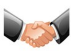
JV Insider Formula