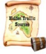
Hidden Traffic Sources